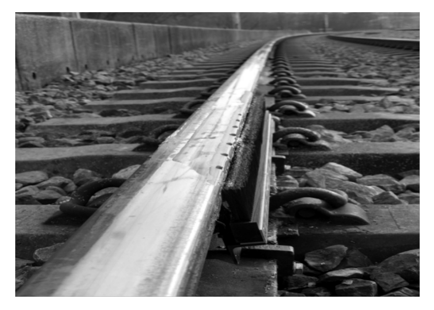
Fig. 1. Dosing borings of CL-E1 top anti noise system Bild 1. Bohrungen des CL-E1 Anti-Lärm-Systems

CL-E1 top anti noise system with patented boreholes offers reasonable noise reduction despite extremely low consumption of CHFC material. The whole system can be installed also in the middle of the curve and underground. CL-E1 provides also reduction of rails and wheel life cycle cost. CL-E1 reduces environmental pollution with metal filings. Our measurement showed reduction from 2218 kg to 779 kg per year on the curve with radius r = 400 m and length l = 60 m.