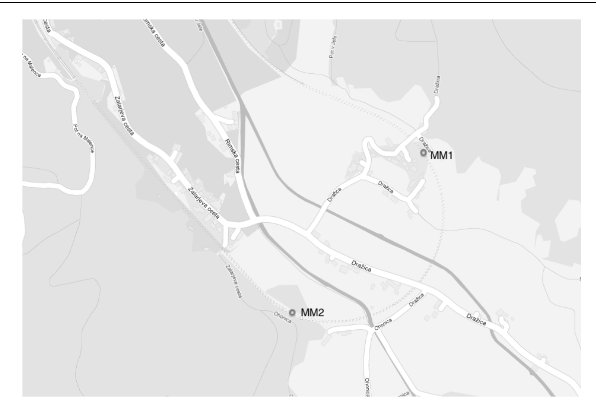
Fig. 2. Measurements points Bild 2. Messpunkte

After several measurements we gained the following results. In the Table 3 we see the average sound levels measured at two measurement points MM1 and MM2. We have average values for passenger and freight trains without and with usage of CL-E1 top anti noise system in [dB]. In the last two columns we see the average sound level reductions for passenger and freight trains respectively.