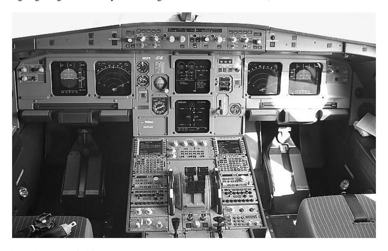
Fig. 1. The cockpit of Airbus A319CJ Rys. 1. Kokpit Airbus A319CJ

Development of Airbus A 319 aircraft (Fig. 1) began on June 10, 1993 and the first's machine's roll-out took place at the production plant in Hamburg on August 24, 1995. It took off for its 3.5 hour long virgin flight the next day. Its next flight tests followed in Toulouse, France.