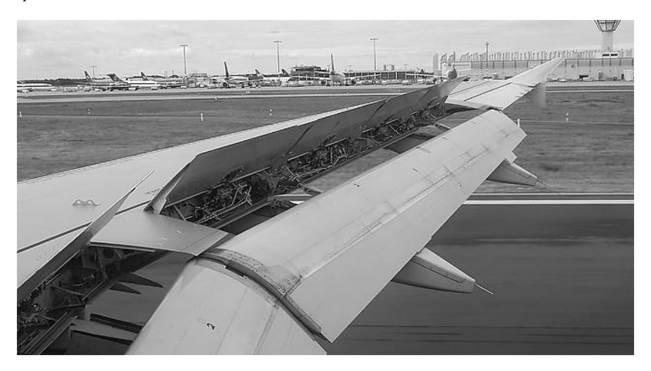
Fig. 4. Wing mechanization of the A319CJ airplane Rys. 4. Mechanizacja skrzydła samolotu A319CJ

The aircraft is powered by two turbofan General Electric/Snecma CFM 56-5B7 engines with high bypass ratio and maximum thrust of 120 kN at take-off. It is also equipped with an auxiliary power unit (APU), which supplies the aircraft systems in the case of shutdown engines. Basic tactical and technical data of the A-319CJ are as following: maximum gross weight 75 500 kg, cruise speed 870 kph, cruise Mach 0.80, maximum FL 390.