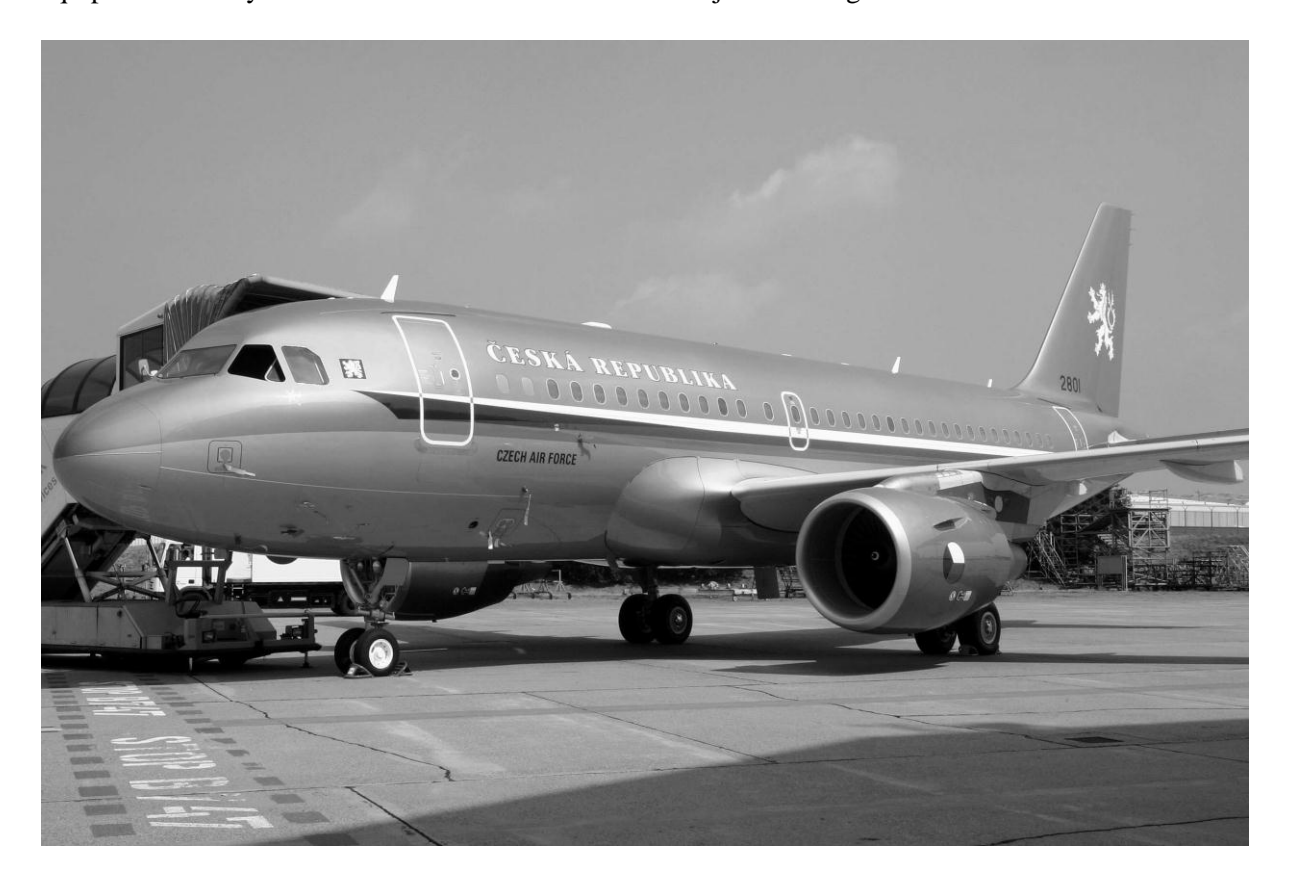
Fig. 2. The Airbus A319CJ airplane in national colours

It is obvious just from this general characteristic, that it is the same type, though with entirely different technical solution and with unlike technical parameters, equipment and quality of manufacturing. The main differences between A319CJ aircraft of the Czech Air Force (Fig. 2) compared with the Czech Airlines' link aircraft are in the power unit, which incorporates the CFM 56-5B/7P engines with higher nominal thrust of 15.5 kN, 4 700 km longer maximum range with additional fuel tanks (in the VIP version). Another differences are represented by the installation of the communication centre, cryptographic communication system, installation of intrusion protection system etc. From the operational point of view, the 92% system identity and 87% navigation and equipment identity of both versions of the aircraft is a major advantage.