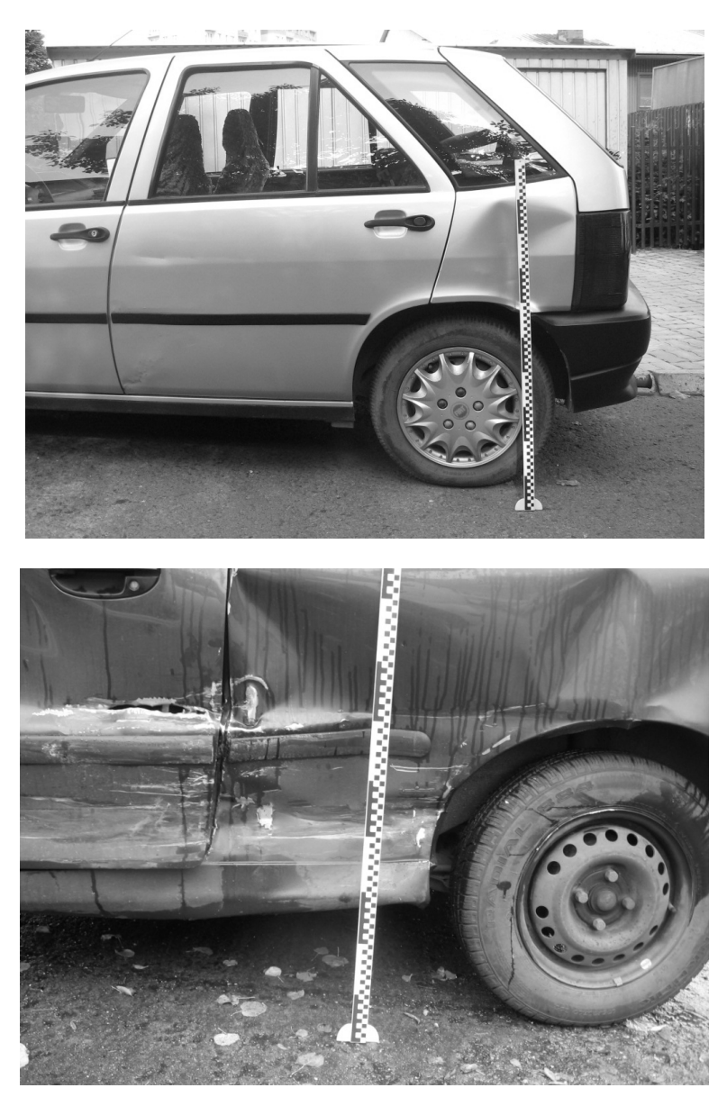
Fig. 1. The example photo documentation of the vehicle damage Rys. 1. Przykładowa dokumentacja zdjęciowa uszkodzeń pojazdu